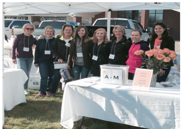
Volunteers help with the race & events.

Every runner had a story and a reason for being there. Some had steadily trained with an eye on the first place prize. Others had decided that morning to run. A few accompanied a friend or spouse, holding back on his own ability and letting the weaker one set the pace. It was exciting to hear that cancer, aging, childbearing, loss of a limb, little time to practice—none of these challenges deterred runners and walkers from being at the 4 th Annual Hope for Nica 5K. “We run for the food!” one woman told me enthusiastically after the race, as she dished out homemade yogurt and granola, fresh fruit and delicious pastries from the food table. The race was exciting; the activities and food afterward were rewarding and memorable. The best part is that participants shared a satisfying experience and became anonymous benefactors to the children of El Padul Christian School in Nicaragua. This was truly an exciting race, well run!