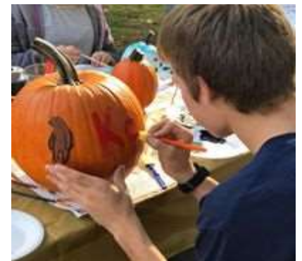
Oct. 14th: "Mini Mac" day at Camp Winamac, a first-time, follow-up event to Youth Camp.