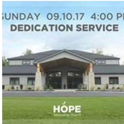
Hope's Building Dedication Service was held in September with a special Message, prayer of dedication, pizza and time of fellowship.