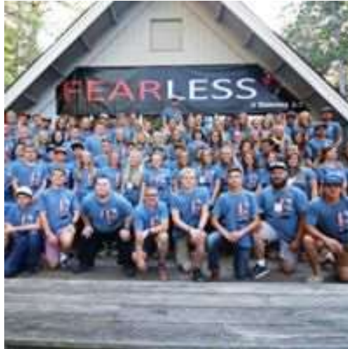
July 27-29th: "Fearless" was the theme for Camp Winamac Youth Camp in Greenfield, NH this year.