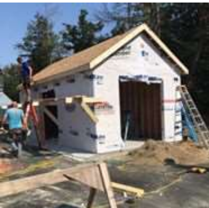
Storage shed goes up in October thanks to generous guys who donated time and labor!