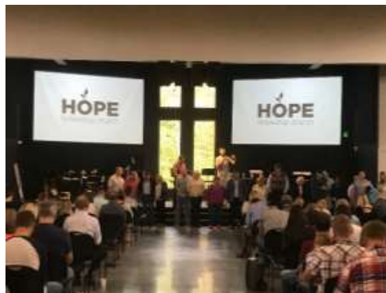
Oct. 15th: New people are blessed in as Hope members.