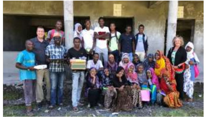
One of the four villages that we visit in "Narnia"

When we visited late last year we called on the same family in their new apartment. We were able to pray for the whole family with the Muslim spouse present. This year we visited them again. They had moved to a new location. However, this time they owned the home. We prayed for the family and the Muslim spouse prayed for us. Two years ago, what seemed like a grim story of persecution has flipped totally to