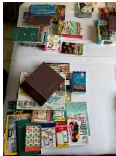
Material donated for libraries

where the Lord has blessed this family with their own home with considerably more room and a thriving vegetable garden. By the grace of God, the situation has been used for good. (And we know that for those who love God all things work together for good, for those who are called according to his purpose. Romans 8:28 ESV).