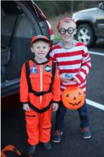
October 2017: Kids and families enjoyed the "Trunk or Treat" event in Hope's Parking lot.