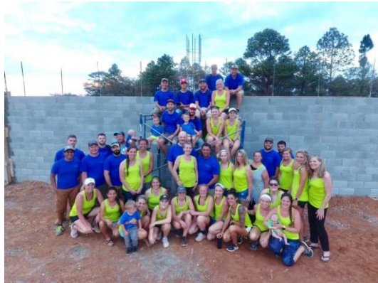
A team of forty-three went to Guatemala.